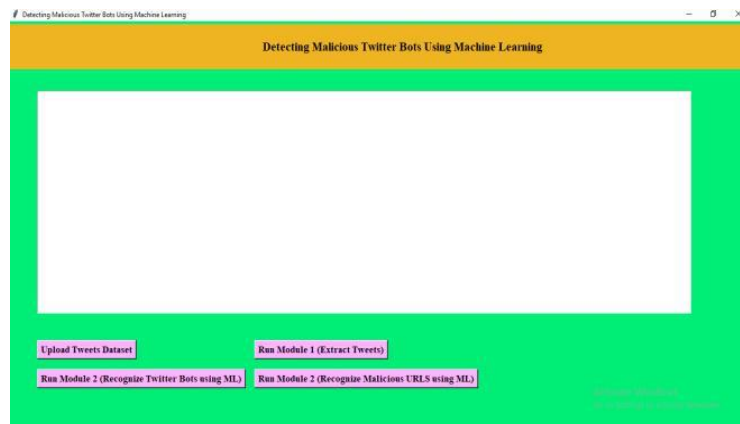
Fig.2: Home screen