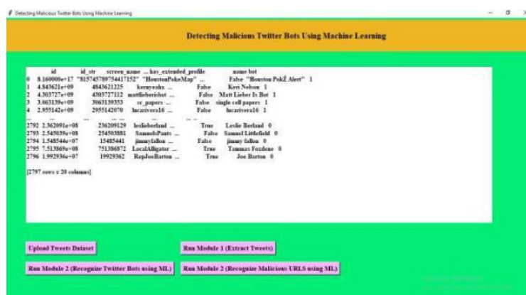
Fig.5: Displaying tweets