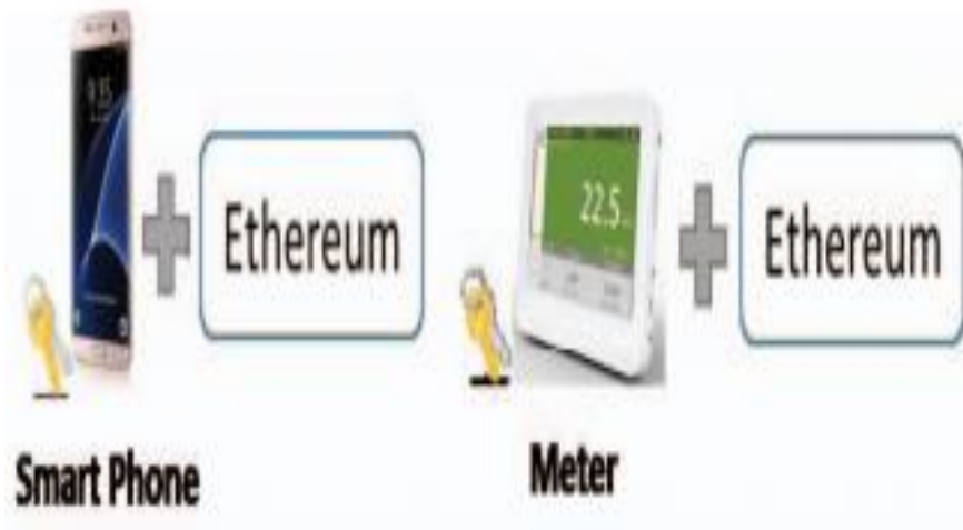
Figure 1: Devices connected to Ethereum

Researchers understand that transactions are processed and recorded via consensus algorithm since blockchain is largely confined in contributing devices, thus attackers can't easily counterfeit or tamper with data. We can develop an IoT system that is strong enough to withstand many, if not all, denial of service and forgery assaults by leveraging this property. Despite the fact that we have only been given a few devices to work with for this paper, we believe we will be able to synchronize hundreds of them.