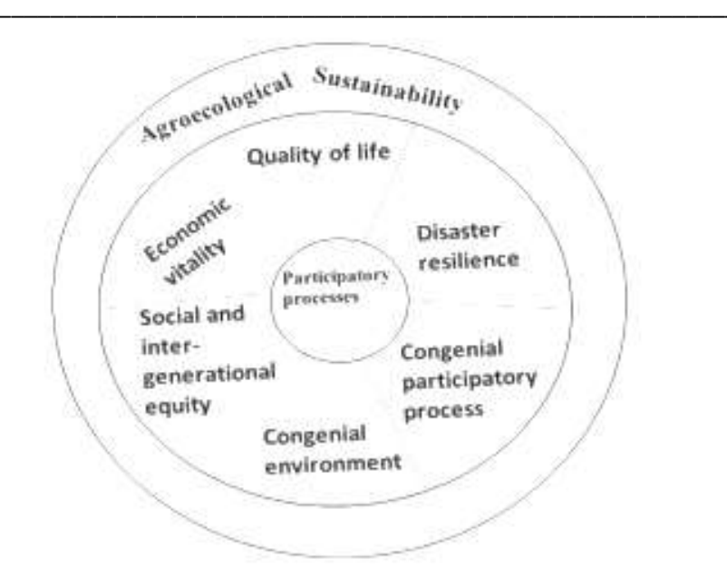
Figure 2: Agricultural sustainability for sustainable development of Indian Agriculture.

Congenial environment: The focus of a sustainable community is a substantial eco-friendly environment and congenial coexistence. Protection of existing resources and the recovery or restoration of damaged ecosystems (such as mining impacts and land use changes) may be required to maintain a pleasant environment in order to achieve sustainability.