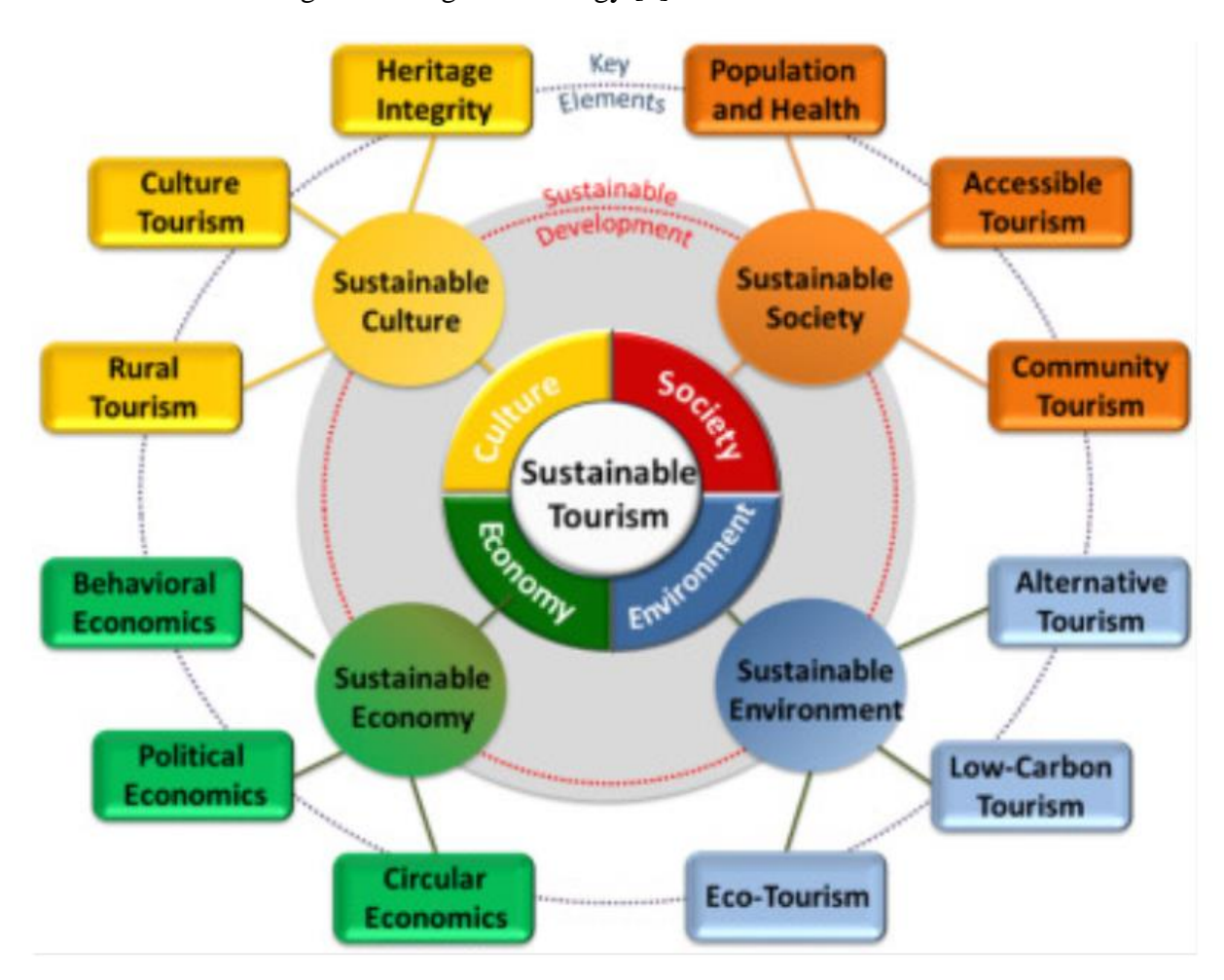
Fig. 1: Tourism In Connection With Factors like Economy, Environment, Culture, and Society.

manmade planned infrastructure development (Fig. 1). The impact of the pollution level from human activities had a very bad effect on the climate and this is responsible to think about the causes of climate change and mitigation strategy [5].