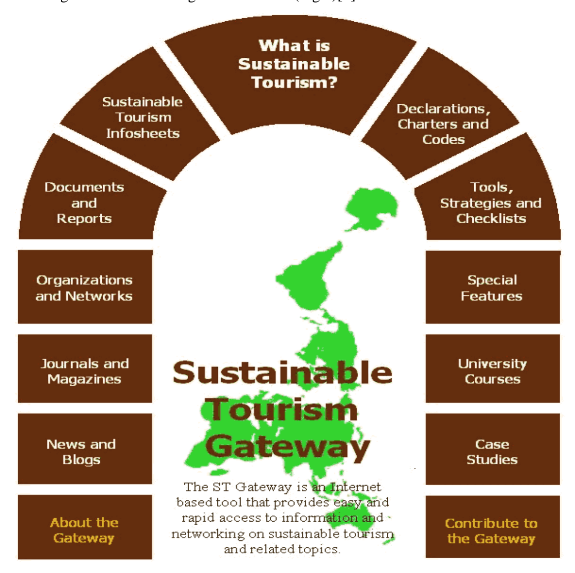
Fig. 3: Promotional Medium Used For Propagation of Measurement of Sustainable Tourism [8]

contribution holiday business can brand to economic, communal, political besides environmental progression of emerging countries, and encounters to and position of travel in industrial nations. Concern for sustainability, and environmental organization methods which give to it, as of significant significance in future growth of travel (Fig.3)[7].