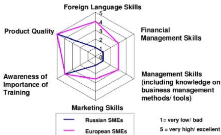
Fig. 3: Business Development Model and Skills or Competencies.