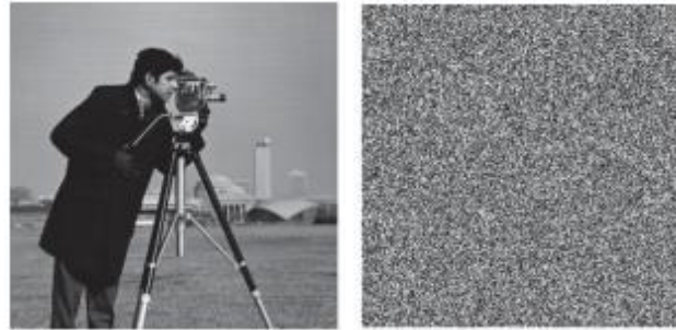
Figure 1: Illustrates the real and encrypted images.