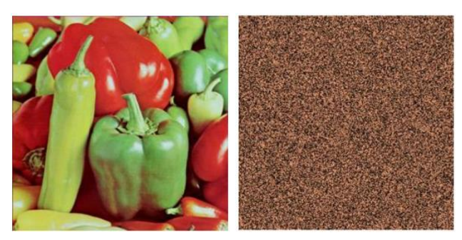
Figure 1: Illustrates the real and encrypted images.