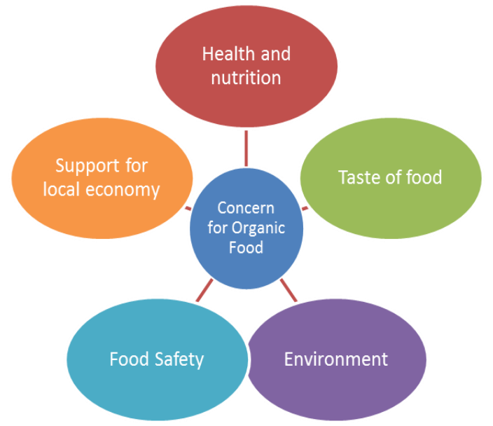
Fig. 2 The Major Concern Of The Organic Food

There are several studies showing the contradictory suggestion as per the demography variation in the view of the people about organic farming but there are also some consistence results about the organic farming in some part of the world. The studies shows that female are more conscious about the organic food than their male counterpart [8]. In spite of this, many people have been attracted towards the organic food as they know that organic food are having more nutrition than conventional food [9]. Younger people are more curious about the consequence of the organic food and they are taking interest to read the available information about the organic farming and organic food. After a good promotion in the market, a good number of the people are attracting towards the organic product.