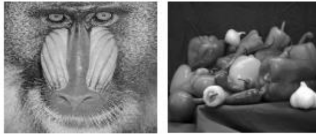
(a) Real Images

For image encryption, there are certain important properties that can be highlighted as critical, particularly overhead bandwidth and computational costs. Photos are typically transmitted in the form of compression nowadays. Therefore, by combining encryption with compression while keeping image communication secret, it is a good strategy to reduce bandwidth and compute load [2]. Figure 1: Illustrates the (a) Real Images (b) Encrypted Images (c) Recovered Real Images. Figure 2: Illustrates the encryption scheme procedure.